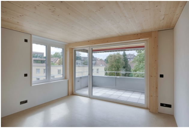
Passage to the balcony