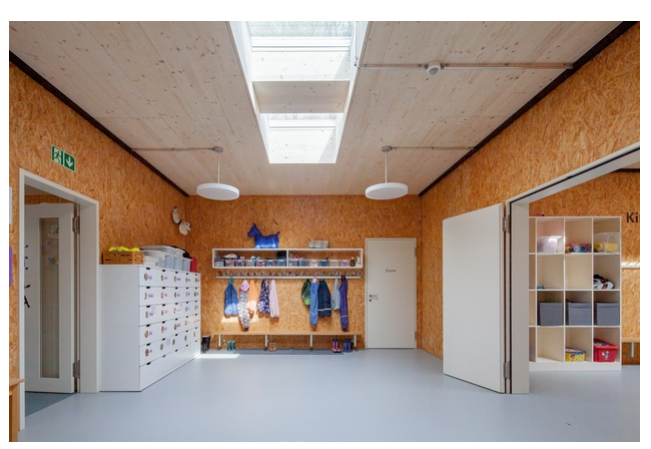
TS3 Timber Structures 3.0 · Thun www.ts3.biz