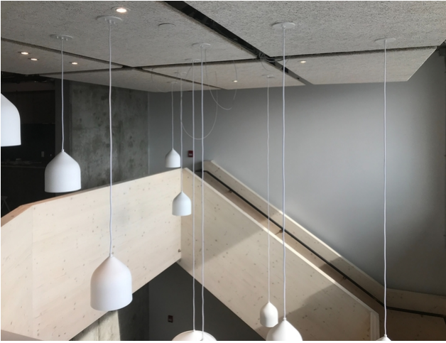
The first staircase with TS3 technology